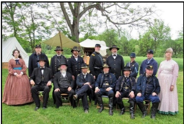
Ellwood Manor Site, Wilderness Battlefield 2019